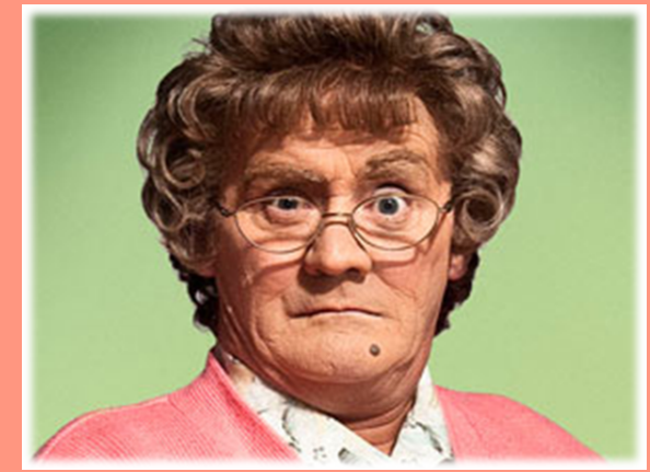
The Granny Rule

If you wouldn't show a picture to your granny then it probably shouldn't be online!